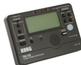
Tuner/Metronome Combo (Recommended model: Korg TM-60)

These supplies will be used daily and can be purchased from any local music store .