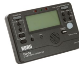
Tuner/Metronome Combo (Recommended model: Korg TM-60)

These supplies will be used daily and can be purchased from any local music store .